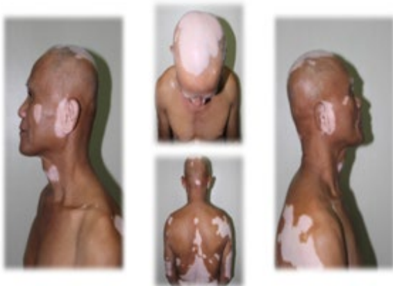
Figure 1. Generalized Vitiligo (pictures were taken with patient's permission through a written consent)

Seven-years prior to consult, still with the aforementioned signs and symptoms, the spot baldness and patches of lighter skin increased in size and number, now involving the upper extremities. Patches of white lashes were also present. There was a noted loss of axillary and pubic hair. Photophobia was also noted. There was no change in the patient's hearing and refutes any incident of persistent headache. Still, no consult was done and no medications were taken.