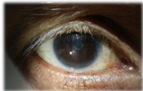
Figure 3. Poliosis on both Upper and Lower Lashes (pictures were taken with patient's permission through a written consent)

The patient had serial follow-ups from the initial consult. He was started on atropine sulfate and prednisolone acetate eye drops which was gradually tapered throughout the treatment. Intraocular pressure for both eyes were normal, however, it was oc-