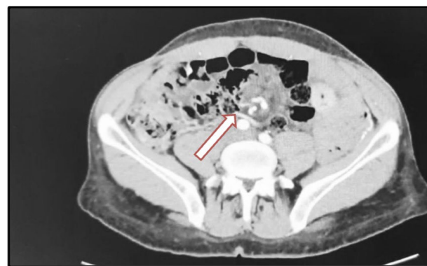
Figure 1. CT-Scan Showing Central Abdominal Swirl Sign

A computer tomography scan (CT-scan) urgently done, showing dilated and thickened small bowel loops, and swirling of the it to vessels and fat at the centre of the abdomen, mild pelvic fluids and enlarged mesenteric lymph node consisted of internal hernia (Figure 1). The surgical team discussed the result with the patient, and he agreed to go for surgery.