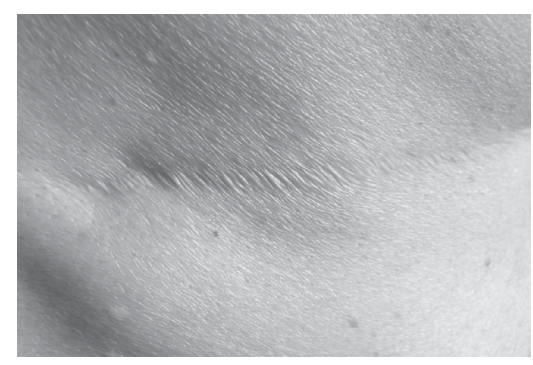
Figure 1: Atrophic scar in EDSH.

Skin ultrastructural abnormalities still represent an important aid for the EDSH diagnosis.<sup>19,21,26-32</sup> Each ultrastructural dermal changes, although individually unspecific appeared relevant and contributed to the diagnosis. Ultrastructural examinations revealed collagen and elastic fiber changes that were more obvious in the reticular dermis. The collagen scaffolding was altered showing bundles with uneven fibril sizes. Some fibril outlines were discretely serrated, and others showed flower-like transversal sections. Some fibrils appeared whirled and the interfibrillar spaces were unevenly enlarged (Figure 2). Elastic fibers exhibited irregular contours. The combination of such aspects was absent in skin samples from normal individuals. In short, ultrastructural changes were not only focused on flowerlike collagen fibrils, but rather on the erratic orientation of the collagen fibrils, and their irregular interfibrillar spacing,<sup>29,31</sup> as well as on abnormal elastic fibers, granulo-filamentous deposits and large stellate hyaluronic acid-like globules.<sup>30-31</sup> Some of these non-fibrillar deposits combined with thinned collagen fibrils were possibly related to alterations of tenascin-X.24,25