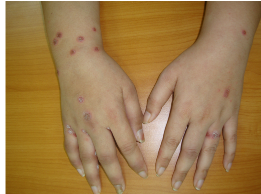
Figure 5: Guttate psoriasis. Multiple, small, discrete, well demarcated, salmon color raindrop-shaped lesions with silvery scale of both hands with dactylitis; sausage shape right digit (on day 4 of presentation to the hospital).

temporo-mandibular joints were tender and very painful to mild touch. Right hand showed dactylitis of the little finger with sausage shape look (Figure 3B).