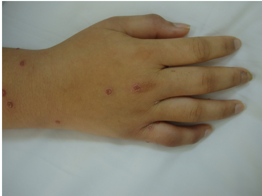
Figure 4: Guttate psoriasis; well demarcated, multiple, discrete, drop like salmon-pink lesions and fine scale with dactylitis; sausage digit (on the first day of presentation to the hospital).