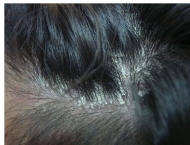
Figure 2: Scalp Psoriasis. Plaque psoriasis characterized by elevated lesions covered with silvery white dry scales.