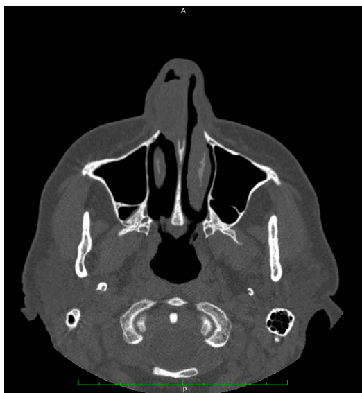
Figure 1: Axial Computed Tomography (CT) Scan without Contrast Showing a Soft Density Polypoid Mass Occupying the Anterior Portion of Right Nasal Fossa, Associated with Cartilaginous Nasal Septum Perforation. The Tissue Arises from the Cartilagineal Portion of Nasal Septum and is in Contact with the Lateral Wall of the Nose. Minimal Signs of Body Erosion are Present. Around Structure and Maxillary Sinus are Not Involved.

Underwent a trans-nasal endoscopic excision of the mass under general anesthesia. Histological examination showed mixed inflammatory cells T-lymphocytes (CD3 + , CD56 + ), histiocytes (CD68R + ) and granulocytes associated to fibrin necrotic material and vascular structures with elastic lamina fragmentation and lumen obliteration. Due to the histological suspicion of a vasculitides, Dosage of c-ANCA e p-ANCA antibodies revealed the presence of GPA (the complete immunological tests are reported in Table 1). The post-operative course was uneventful, and the