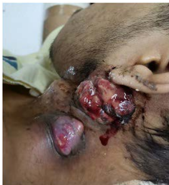
Figure 4. Photograph of Patient Post-Embolization on Day 5

of neck dressing with minimal oozing (Figure 4). He was prescribed with oral morphine which was changed to Codeine plus paracetamol combination as he felt dizzy with morphine. Oral antibiotics continued for one week. Patient is still alive with no further episode of bleeding (2.5-months).