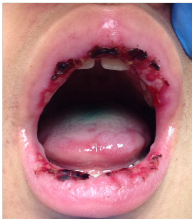
Figure 1: Oral lesions seen in a 14 year old patient with Stevens-Johnson syndrome without skin lesions.